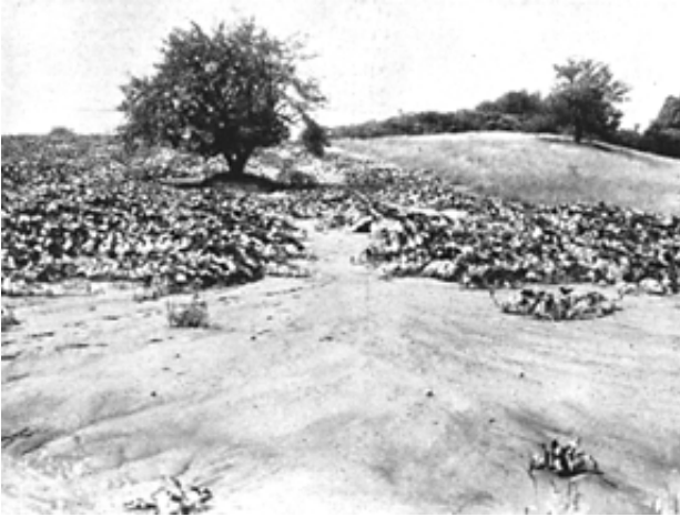
Figure 5.--an area of wind erosion in New Hampshire.