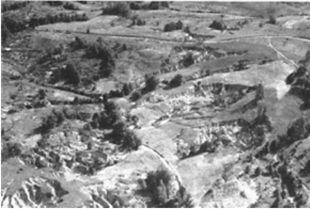
Figure 6.--Eroded farm lands of Mississippi

Water was regarded by Sorsby as the most destructive agent in the agricultural system (fig. 6). It was very difficult to control because it was movable, always seeking its own level. When in motion, an increase in the volume of the water rapidly increased its power of destruction. Its power to erode the land was dependent on the length of the slope, the depth of plowing, the character of the soil, and the quantity of water in motion.