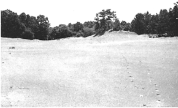
FIGURE 1.--Blow sand on the margin of a wooded area in Connecticut.

To prevent the blowing and drifting of sand, Deane (6, p. 161 ) recommended hedge fences as well as plantations of locust trees.