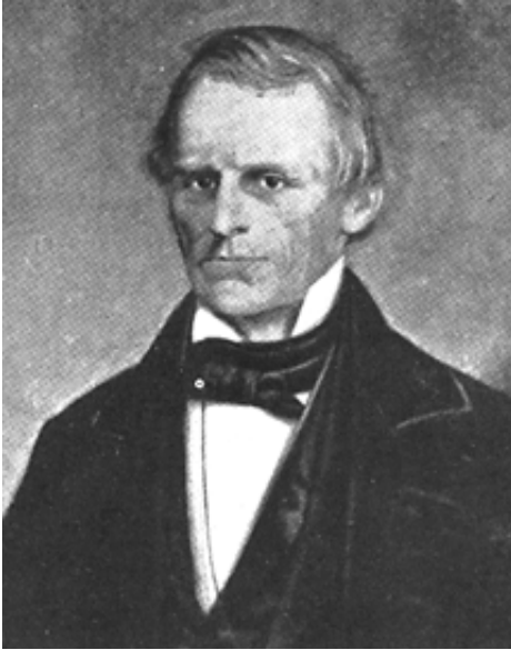
Figure 4.--Isaac Hill, pioneer soil conservationist of New Hampshire.

In spite of the handicaps of lameness and of a frail physique, Isaac Hill became the most important agricultural reformer in New Hampshire and the champion of erosion control. He was accused by his political opponents of being insane. At an early age, he embarked on a newspaper career and assumed the editorship of the New Hampshire Patriot in 1809.