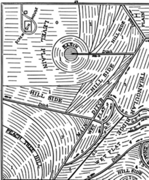
Figure 7.--Sorsby's plan for diversified erosion control on a 45 acre plot: 0, Straight rows run by the eye; 1, level culture; 2, level culture with guard drains; 3, grading method No. 1; 4, grading method No. 2; 5, grading method No. 3.

Above a gully head sufficient slope was provided if the level were set so that the plumb fell opposite the 1-inch mark of the graduated crosspiece. The span of the level was about 15-1/2 feet. If a main ditch was necessary, the rows were not emptied directly into the ditch. Either a drain or two parallel rows were run parallel to the ditch so that the water would drain off gradually. Sorsby seemed unaware that this practice also might cause gullying.