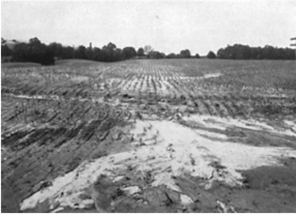
Figure 3.--Erosion and sedimentation on a Virginia cornfield.

This deplorable condition had been in part caused by the three-shift system of corn, wheat, and pasture, in which the soil received neither rest nor fertilizer, and was trampled by the stock. Taylor had little confidence in rotations devised to mitigate the evils of this system (fig. 3). "Trust not," he advised, "to the delusive promises of a rotation of crops for restoring our soil. It will aggravate the evil it pretends to remove" (33 p. 222). Still worse was reliance on rotations on farms entrusted to overseers (33, p. 76):