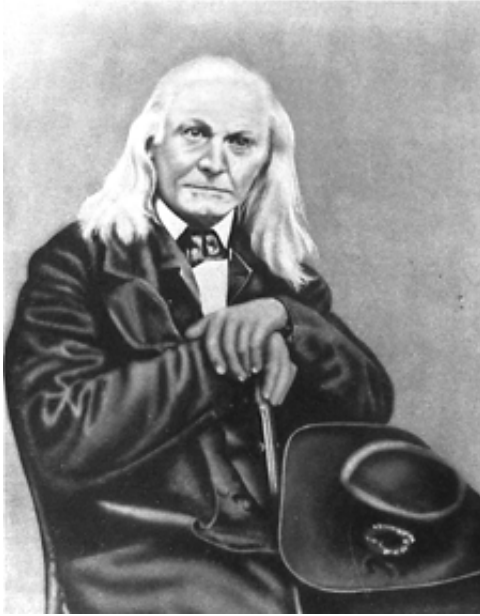
Figure 8.--Edmund Ruffin of Virginia.